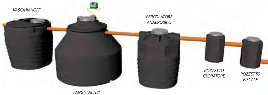
TABELLA 4 - SCARICHI CONGIUNTI SUL SUOLO